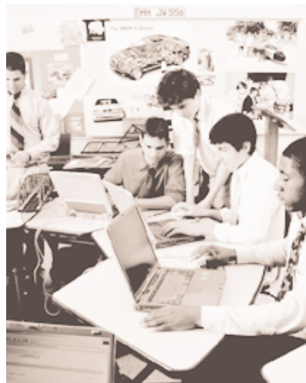
Pre-engineering students use technology and learned skills to solve problems.