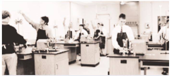
Hands-on experiments provide learning experiences for Chemistry students.