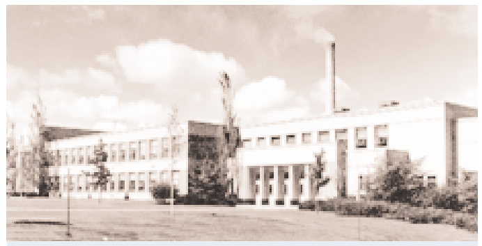
St. Edward High School in 1950.

During the past 55 years, over 14,000 young men have entered the halls of St. Edward High School. Our graduates have set the stage for the 21st century as leaders in media, in business, in politics and throughout the Congregation of Holy Cross. When asked about their experiences and