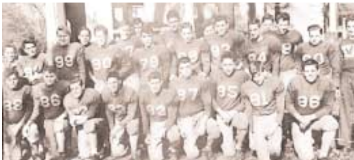
St. Edward High School's first football team.

"What about you?" he asked as if waiting to hear how I planned to make my mark over four years at the school.