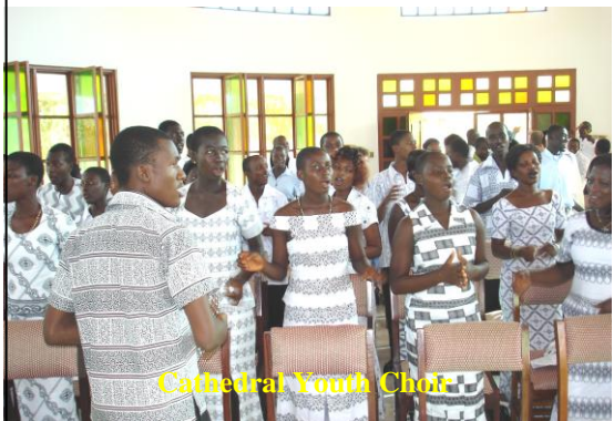
Cathedral Youth Choir

The slow-paced Eucharistic Celebration ended about the time in which the proclamation of the beatification of Venerable Basil Moreau was to occur at Le Mans. Thus, proximate to this time, in Blessed Andre Chapel, the veil was removed that had covered the portrait of Blessed Basil Moreau, (painted by Bro. David Kpobi), and the proclamation of the beatification was read. Much jubilation ensued, as the portrait was carried around inside the chapel and placed in a temporary shrine behind the altar. Some singing and dancing continued following the formal recessional.