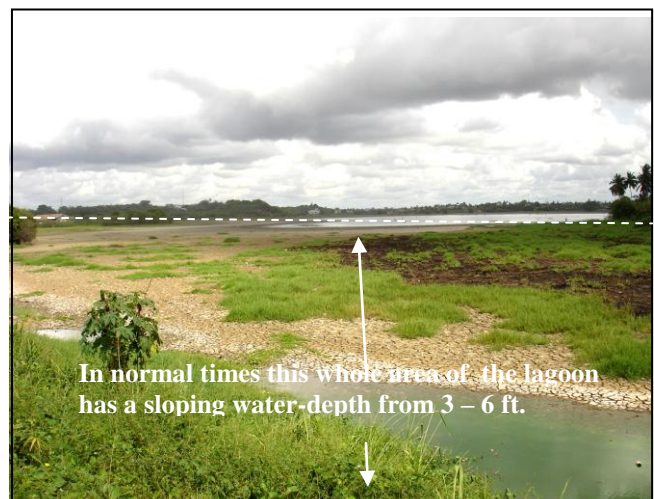
In normal times this whole area of the lagoon has a sloping water-depth from 3 – 6 ft.

Presumably some readers of this newsletter outside our District of West Africa, who have at one time or other visited Cape Coast, would surely remember the sight of the beautiful lagoon. Probably, too, there would be the image recalled of individual fisherman casting their large