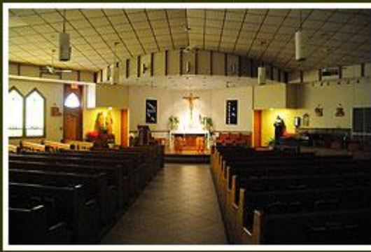
The inside of St. Rita Church, Dade City, Florida. The Eastern Province took over the Spanish speaking parish in July of 2008.